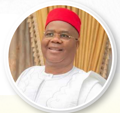
Rep. Anayo Onwuegbu (PDP, Enugu)