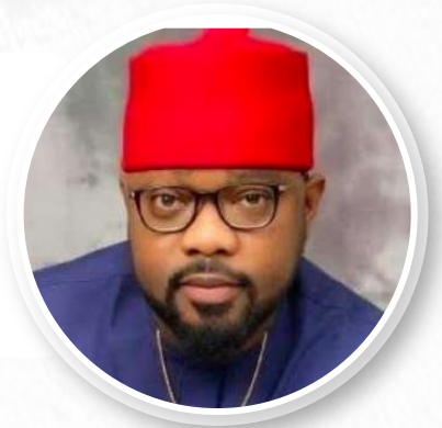
Rep. Ikeagwuonu Onyinye Ugochinyere (PDP, Imo)