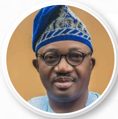
Rep. Abiodun Francis Omoleye (APC, Ekiti)