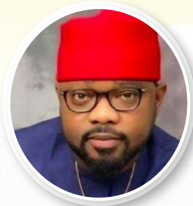
Rep. Ikeagwuonu Onyinye Ugochinyere (PDP, Imo) and 4 others

Monday 14th October - Friday 19th October, 2024