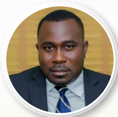
Rep. Akiolu Kayode Moshood (APC, Lagos)