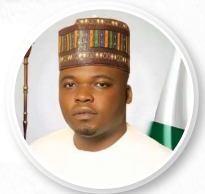
Rep. Alfred Ajang Iliya (LP, Plateau)