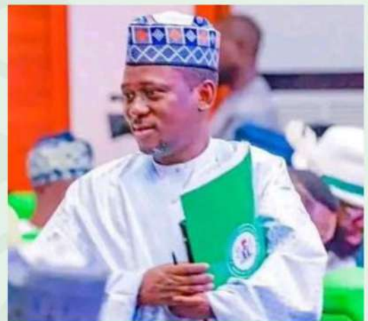
Rep. Ali Isa JC (PDP, Gombe)

6. State Caucuses: This caucus comprises members of the House of Representatives elected to represent the various federal constituencies within a particular state, typically elected on the platforms of various political parties. There are 37 State Caucuses in the 10th House of Representatives.