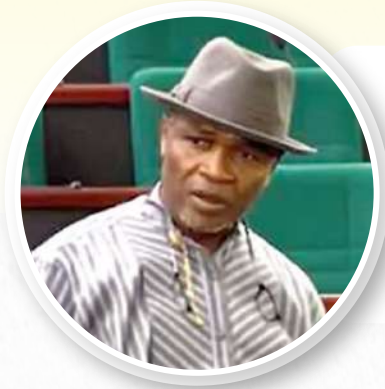
Rep. Kingsley Chinda (PDP, Rivers)

Monday 14th October - Friday 19th October, 2024