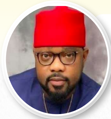
Rep. Ikeagwuonu Onyinye Ugochinyere (PDP, Imo)

Monday 14th October - Friday 19th October, 2024