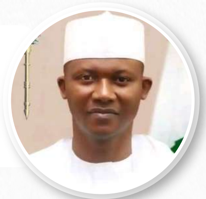
Rep. Ishaya D. Lalu (APC, Plateau)