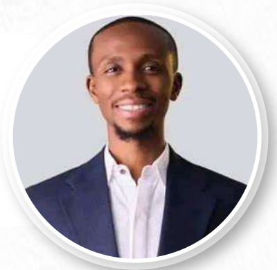
Rep. Mohammed Bello El-Rufai (APC, Kaduna)