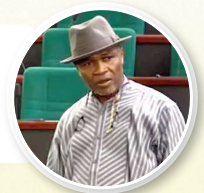
Rep. Kingsley O. Chinda (PDP, Rivers) and 48 others