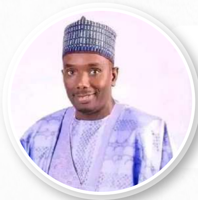
Hon. Mohammed Buba Jajere (PDP, Yobe)