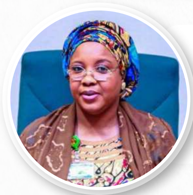
Rep. Kafilat Ogbara (APC, Lagos)