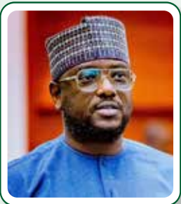
Rep. Babajimi Benson (APC, Lagos)