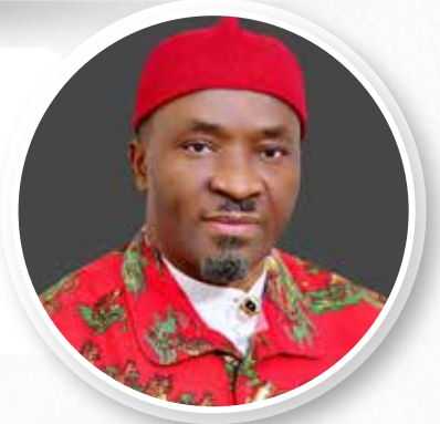
Rep. Benjamin Okezie Kalu (APC, Abia)