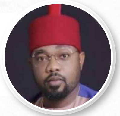
Rep. Ikeagwuonu Ugochinyere (PDP, Imo) & 50 others