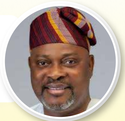
Rep. Moses Oluwatoyin Fayinka (APC, Lagos) & 19 others