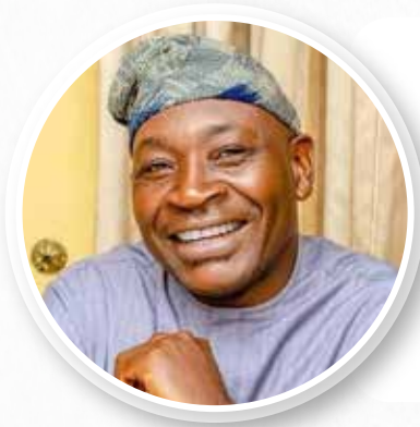
Rep. Solomon Wombo (APC, Benue)