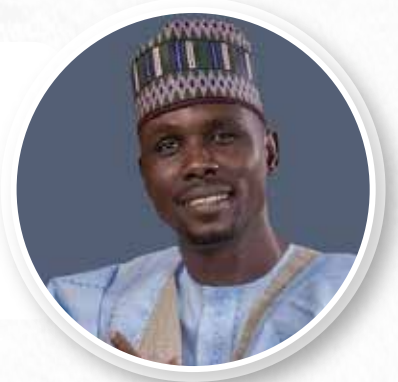
Rep. Ahmed Satomi (APC, Borno)