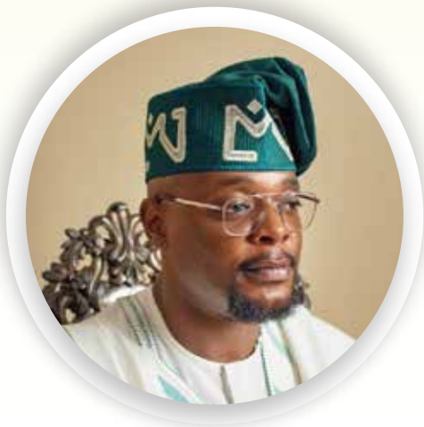
Rep. Olamijuwonlo Ayodeji Alao-Akala (APC, Oyo)

As captured in Order 20, Standing Orders of the House of Representatives (Eleventh Edition), the Committee on Youth in Parliament has oversight jurisdiction over: