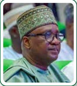
Rep. Abbas Tajudeen (APC, Kaduna) and