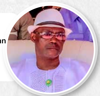
Rep. Abdulrahman Ajiya (APC, FCT)