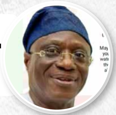
Rep. Dolapo-Badru Enitan (APC, Lagos) and 19 Others