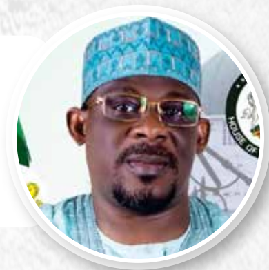
Rep. Bashir Zubairu Usman (APC, Kaduna)