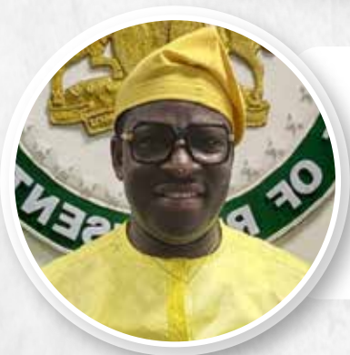
Rep. Billy Famous Osawaru (APC, Edo)