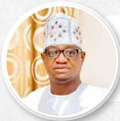
Rep. Olusoji Abidemi Adetunji (PDP, Osun)