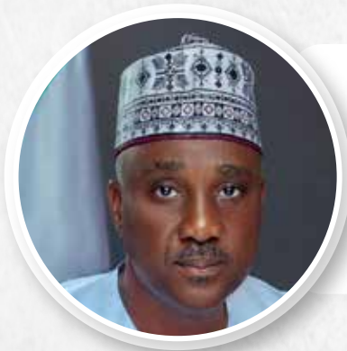
Rep. Abbas Tajudeen (APC, Kaduna)