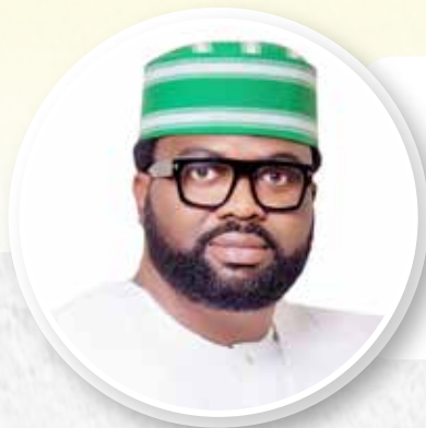
Rep. Akintunde Rotimi (APC, Ekiti)

Monday, 18th November, 2024 - Friday, 22nd November, 2024