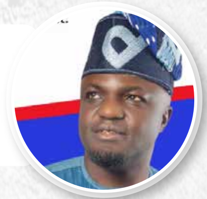
Rep. Adebayo Balogun (APC, Lagos)