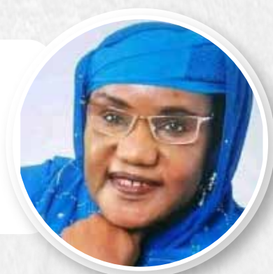
Rep. Fatima Talba (APC, Yobe)