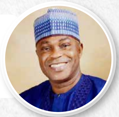
Rep. Abiodun Isiaq Akinlade (APC, Ogun)